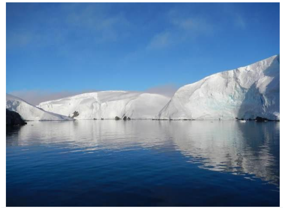
Eighth day, arrival on the Antarctic Peninsula and anchorage in Melchior Harbor for a well-deserved rest