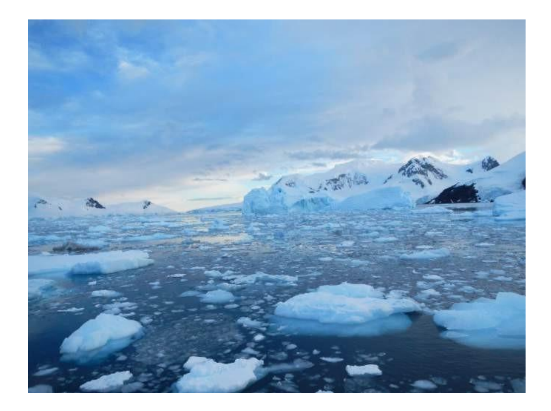
Day 19, return to Paradise Bay